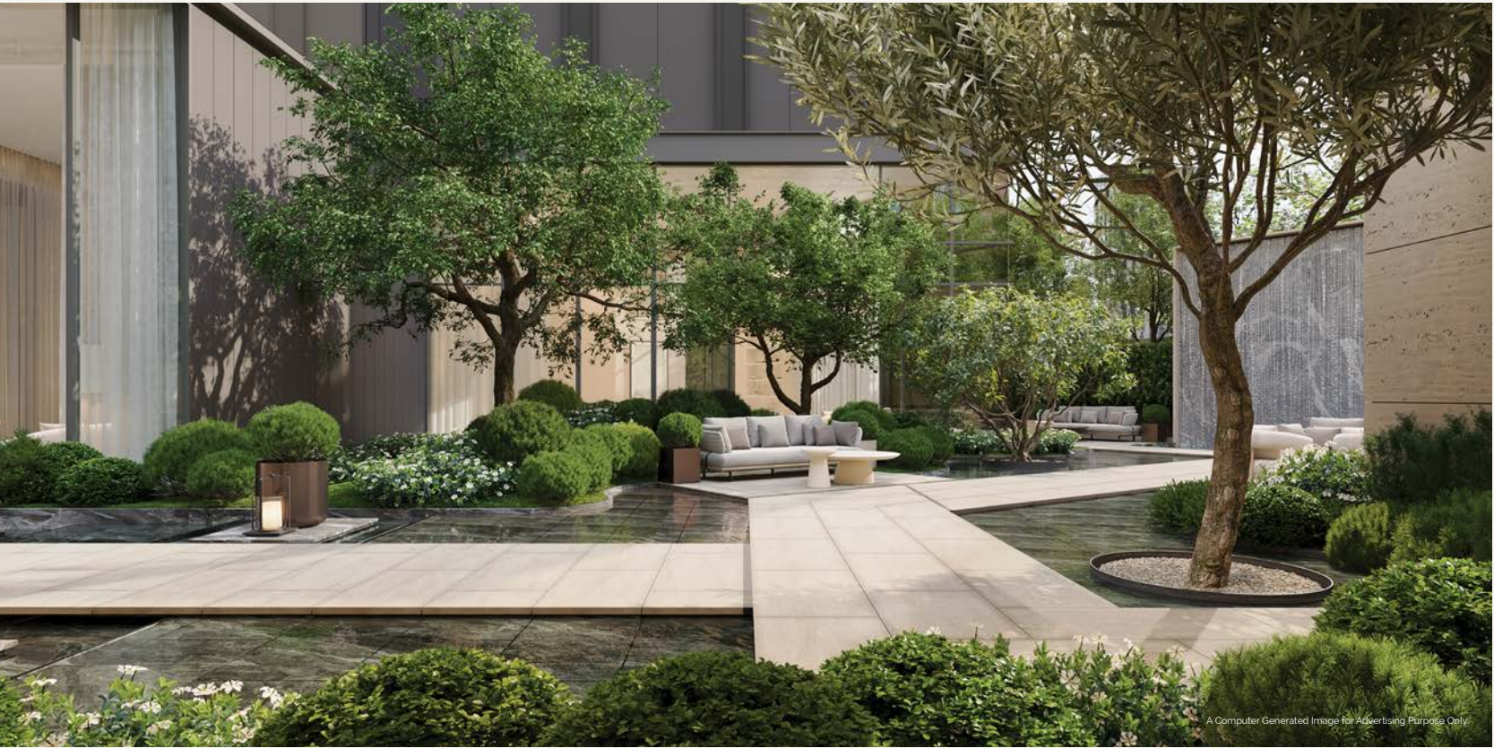
A Computer Generated Image for Advertising Purpose Only

26 th -27 th Floor HEALTH CLUB IN RESIDENCE Poolside Lounge, Home Gym, STILL Pool, Kid's Pool, Thermal Pool, Pilates & Yoga Studio, Movie Room and Golf Room